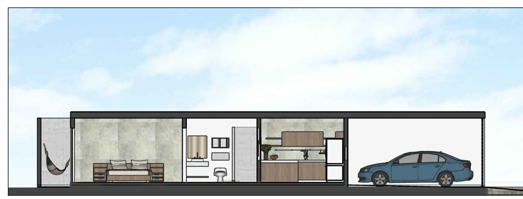
Corte longitudinal Esc. 1:75