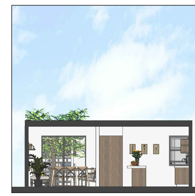
Corte transversal Esc. 1:75